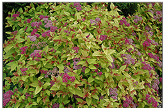
Magic Carpet Spirea flowers