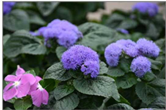
High Tide Blue Flossflower flowers