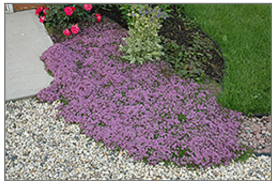
Red Creeping Thyme in bloom