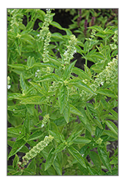
Sweet Italian Basil flowers

This plant is quite ornamental as well as edible, and is as much at home in a landscape or flower garden as it is in a designated herb garden. It should only be grown in full sunlight. It prefers to grow in average to moist conditions, and shouldn't be allowed to dry out. It is not particular as to soil type or pH. It is somewhat tolerant of urban pollution. This is a selected variety of a species not originally from North America. It can be propagated by cuttings; however, as a cultivated variety, be aware that it may be subject to certain restrictions or prohibitions on propagation.