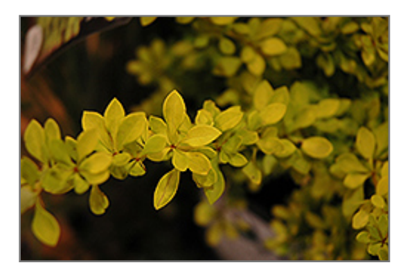
Sunjoy Citrus Japanese Barberry foliage