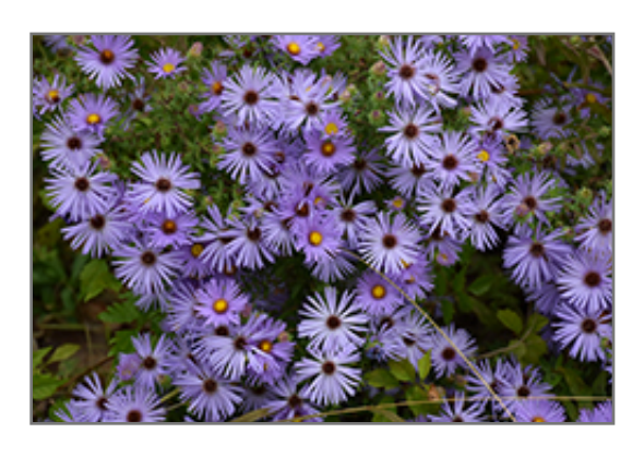
October Skies Aster flowers