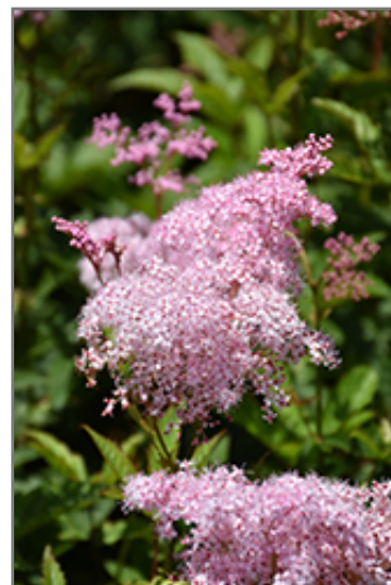
Queen Of The Prairie flowers