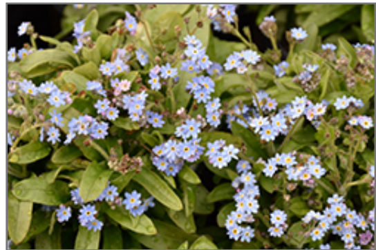
Victoria Blue Forget-Me-Not flowers