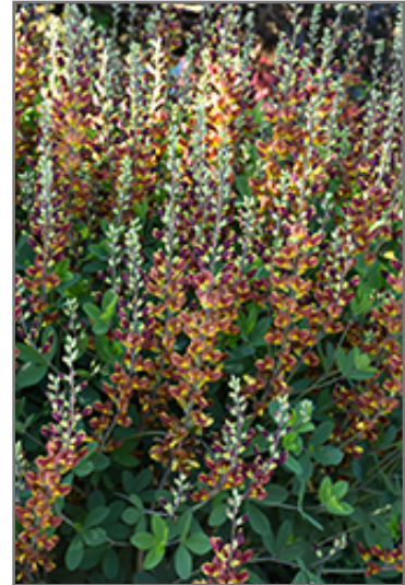
Decadence Cherries Jubilee False Indigo flowers

Decadence Cherries Jubilee False Indigo is a fine choice for the garden, but it is also a good selection for planting in outdoor pots and containers. With its upright habit of growth, it is best suited for use as a 'thriller' in the 'spiller-thriller-filler' container combination; plant it near the center of the pot, surrounded by smaller plants and those that spill over the edges. It is even sizeable enough that it can be grown alone in a suitable container. Note that when growing plants in outdoor containers and baskets, they may require more frequent waterings than they would in the yard or garden.