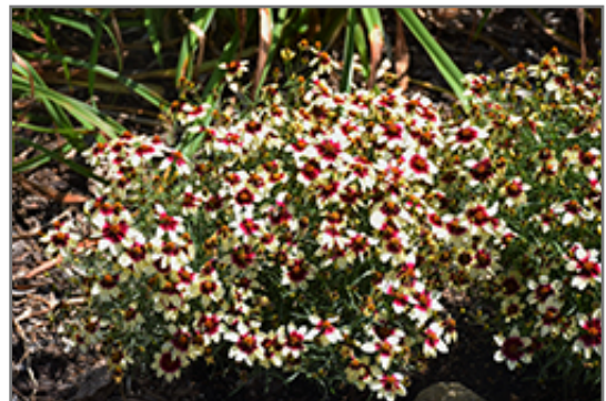
Sizzle And Spice Red Hot Vanilla Tickseed in bloom