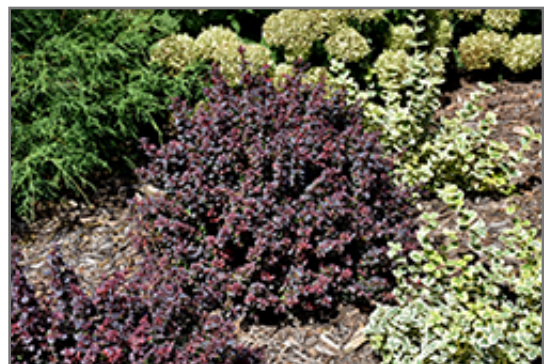
Sunjoy Todo Japanese Barberry