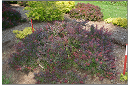
Sunjoy Todo Japanese Barberry

Sunjoy Todo Japanese Barberry will grow to be about 24 inches tall at maturity, with a spread of 24 inches. It tends to fill out right to the ground and therefore doesn't necessarily require facer plants in front. It grows at a medium rate, and under ideal conditions can be expected to live for approximately 20 years.