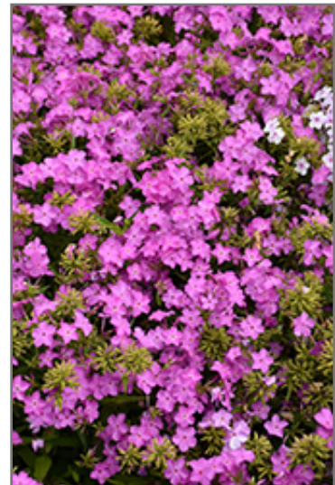
Opening Act Ultrapink Phlox flowers