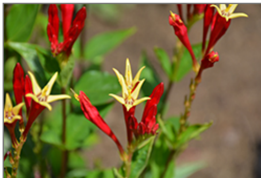
Little Redhead Indian Pink flowers