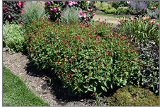
Little Redhead Indian Pink in bloom

Little Redhead Indian Pink will grow to be about 20 inches tall at maturity, with a spread of 24 inches. When grown in masses or used as a bedding plant, individual plants should be spaced approximately 20 inches apart. Its foliage tends to remain dense right to the ground, not requiring facer plants in front. It grows at a fast rate, and under ideal conditions can be expected to live for approximately 5 years. As an herbaceous perennial, this plant will usually die back to the crown each winter, and will regrow from the base each spring. Be careful not to disturb the crown in late winter when it may not be readily seen!