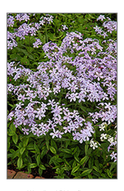
Woodland Phlox flowers

Woodland Phlox will grow to be about 8 inches tall at maturity, with a spread of 18 inches. When grown in masses or used as a bedding plant, individual plants should be spaced approximately 16 inches apart. Its foliage tends to remain low and dense right to the ground. It grows at a medium rate, and under ideal conditions can be expected to live for approximately 10 years. As an herbaceous perennial, this plant will usually die back to the crown each winter, and will regrow from the base each spring. Be careful not to disturb the crown in late winter when it may not be readily seen!