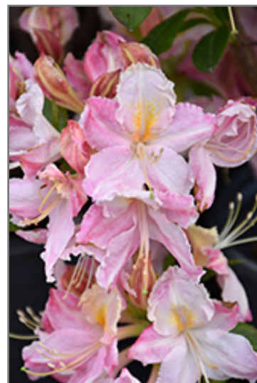
Tri-Lights Azalea flowers