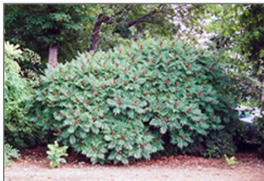
Smooth Sumac in bloom