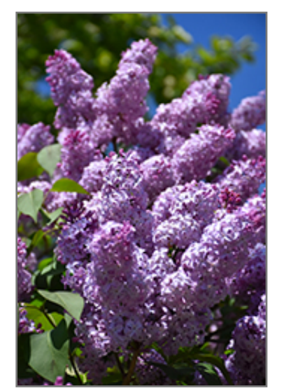
Common Lilac flowers