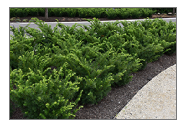
Densiformis Yew

Densiformis Yew is a dense multi-stemmed evergreen shrub with an upright spreading habit of growth. Its relatively fine texture sets it apart from other landscape plants with less refined foliage.