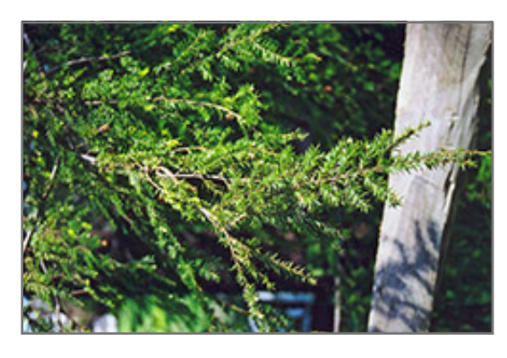
Canadian Hemlock foliage