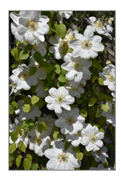
Guernsey Cream Clematis flowers