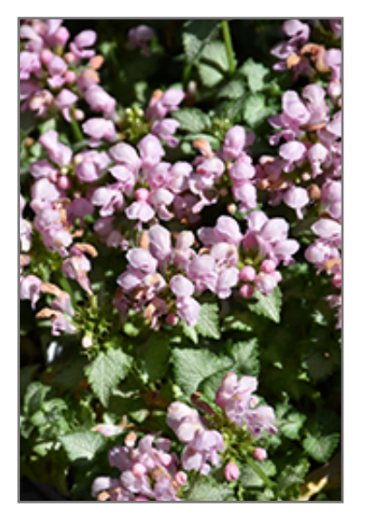
Pink Pewter Spotted Dead Nettle flowers