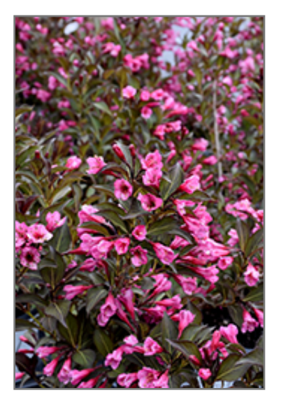
Fine Wine Weigela flowers