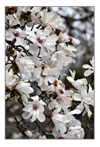
Merrill Magnolia flowers

This tree does best in full sun to partial shade. It requires an evenly moist well-drained soil for optimal growth, but will die in standing water. It is not particular as to soil type, but has a definite preference for acidic soils. It is quite intolerant of urban pollution, therefore inner city or urban streetside plantings are best avoided. Consider applying a thick mulch around the root zone in winter to protect it in exposed locations or colder microclimates. This particular variety is an interspecific hybrid.