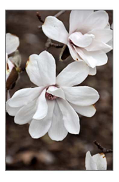
Merrill Magnolia flowers