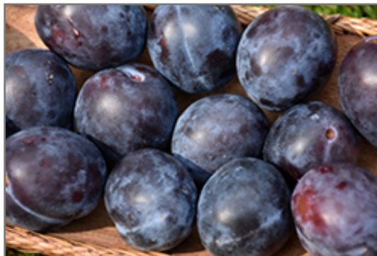
Mount Royal Plum fruit