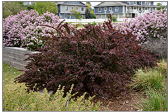
Red Leaf Japanese Barberry

Red Leaf Japanese Barberry is recommended for the following landscape applications;