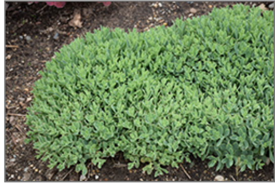
Rock 'N Round Pure Joy Stonecrop

Rock 'N Round Pure Joy Stonecrop will grow to be about 10 inches tall at maturity, with a spread of 15 inches. When grown in masses or used as a bedding plant, individual plants should be spaced approximately 12 inches apart. Its foliage tends to remain low and dense right to the ground. It grows at a fast rate, and under ideal conditions can be expected to live for approximately 15 years. As an herbaceous perennial, this plant will usually die back to the crown each winter, and will regrow from the base each spring. Be careful not to disturb the crown in late winter when it may not be readily seen!