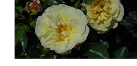
Popcorn Drift Rose flowers

Popcorn Drift Rose is blanketed in stunning double creamy white flowers with buttery yellow overtones at the ends of the branches from late spring to early fall, which emerge from distinctive yellow flower buds. The flowers are excellent for cutting. It has dark green deciduous foliage. The glossy oval compound leaves do not develop any appreciable fall color.