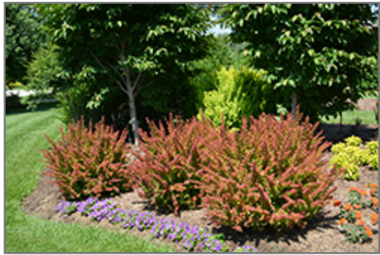
Sunjoy Tangelo Japanese Barberry

Sunjoy Tangelo Japanese Barberry is recommended for the following landscape applications;