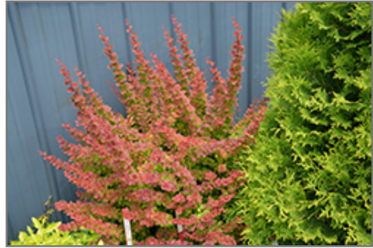
Sunjoy Tangelo Japanese Barberry

Sunjoy Tangelo Japanese Barberry will grow to be about 4 feet tall at maturity, with a spread of 4 feet. It tends to fill out right to the ground and therefore doesn't necessarily require facer plants in front. It grows at a medium rate, and under ideal conditions can be expected to live for approximately 20 years.