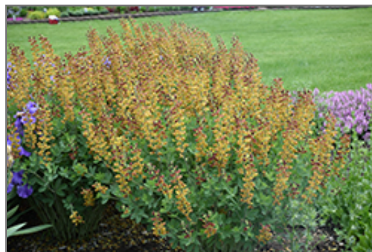
Decadence Cherries Jubilee False Indigo in bloom