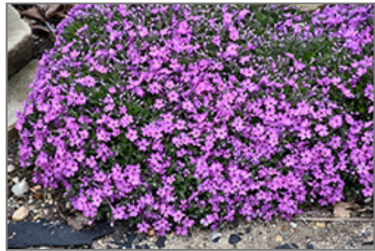
Rocky Road Pink Phlox in bloom