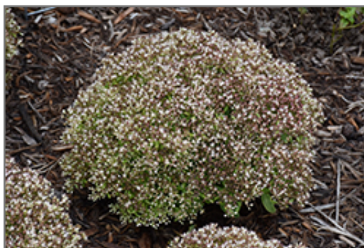
Rock 'N Round Bundle Of Joy Stonecrop in bloom