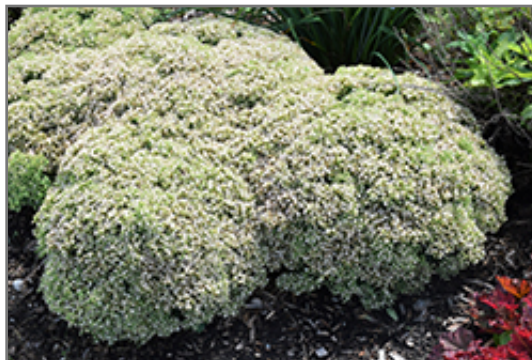
Rock 'N Round Bundle Of Joy Stonecrop in bloom

This is a relatively low maintenance plant, and is best cleaned up in early spring before it resumes active growth for the season. It is a good choice for attracting bees and butterflies to your yard, but is not particularly attractive to deer who tend to leave it alone in favor of tastier treats. It has no significant negative characteristics.