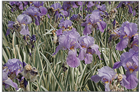
Variegated Sweet Iris flowers