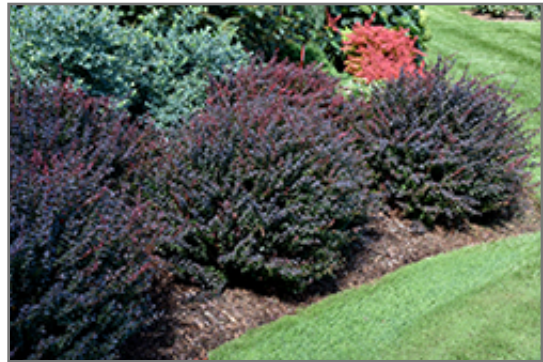
Sunjoy Mini Maroon Japanese Barberry

Sunjoy Mini Maroon Japanese Barberry is recommended for the following landscape applications;