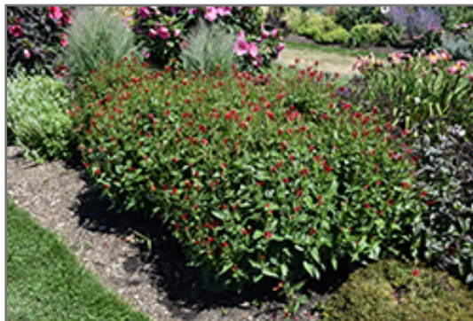
Little Redhead Indian Pink in bloom

Little Redhead Indian Pink will grow to be about 20 inches tall at maturity, with a spread of 24 inches. When grown in masses or used as a bedding plant, individual plants should be spaced approximately 20 inches apart. Its foliage tends to remain dense right to the ground, not requiring facer plants in front. It grows at a fast rate, and under ideal conditions can be expected to live for approximately 5 years. As an herbaceous perennial, this plant will usually die back to the crown each winter, and will regrow from the base each spring. Be careful not to disturb the crown in late winter when it may not be readily seen!