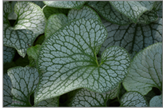
Sterling Silver Bugloss foliage

Sterling Silver Bugloss will grow to be about 12 inches tall at maturity, with a spread of 24 inches. When grown in masses or used as a bedding plant, individual plants should be spaced approximately 20 inches apart. It grows at a medium rate, and under ideal conditions can be expected to live for approximately 10 years. As an herbaceous perennial, this plant will usually die back to the crown each winter, and will regrow from the base each spring. Be careful not to disturb the crown in late winter when it may not be readily seen!