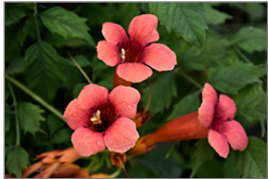
Flamenco Trumpetvine flowers