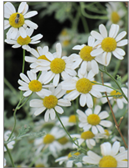
German Chamomile flowers